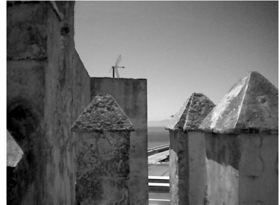
Castle as virtual bridge transmissor / Picture: Pablo de Soto / PhotoDevice: Nokia 3650

We consider that, for a few hours, in fada'iat we were able to deprogram the system of automatisms which we usually react to the reality of geography with. The flux of anonymous data generated by mediatic cooperation achieved to feed a geographic algorithm, free code produced and supported by multiple nodes that managed to fly over and across all directions of Europe Southern border.